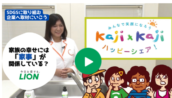
Video about Lion's SDG-Related Initiatives [Japanese] Efforts to Achieve Gender Equality through Housework Sharing

The channel also offers a series of videos highlighting companies implementing SDG-related initiatives. These videos are aimed at helping children understand the SDGs as something familiar and relevant to their lives and help them think about their own futures by showing actual initiatives being undertaken by companies to solve social issues. Lion's initiatives regarding SDGs are featured as follows.