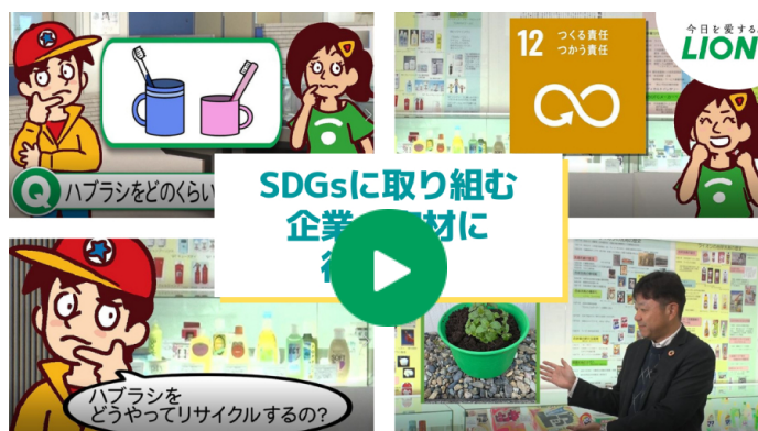
Video about Lion's SDG-Related Initiatives [Japanese] Initiatives to create a healthy future from oral health