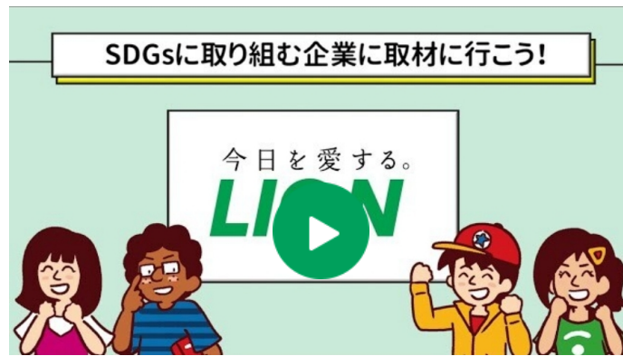
Video about Lion's SDG-Related Initiatives[Japanese] Initiatives to reduce plastics and the importance of hand washing habits